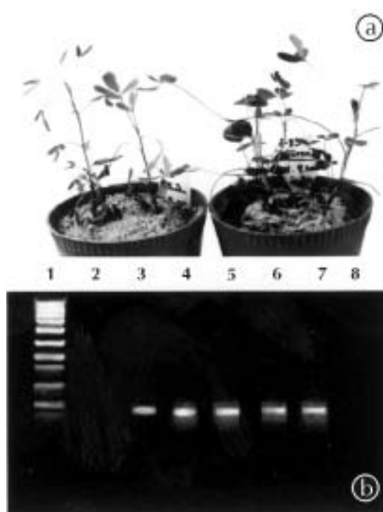
Fig. 2 (a) Transformed (left) and control (right) plants of M. sativa cv. Zaječarska after 2 months of acclimation, (b) PCR analyses of LBA4404/pTOK233 transformed alfalfa embryos and regenerated plants, lane 1 – 1 Kb DNA ladder; lane 2 – blank; lane 3 – LBA4404/pTOK233 as positive control; lane 4 – transformed embryos (clone 1); lane 5 – transformed embryos (clone 2); lane 6 – transformed plants (clone 1); lane 7 – transformed plants (clone 2); lane 8 – nontransformed embryos as negative control.

were then placed on non-selective medium for further propagation, or else transferred to the greenhouse. Within a few months, 60 plantlets were raised in soil (Fig. 2a).