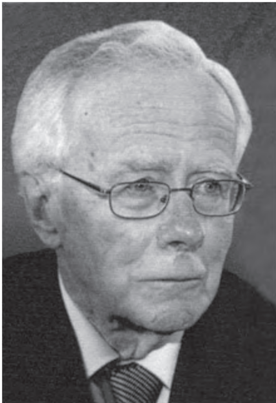
Fig. 2. Portrait of Maciej Zenkteler.

Professor Zenkteler was the author of more than a hundred publications, including academic books or chapters, ten chapters in foreign monographs, and papers in prominent foreign and Polish journals.