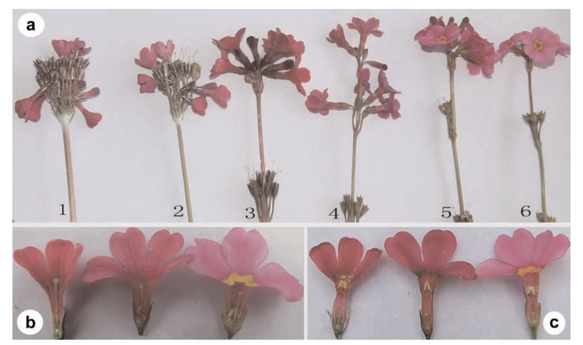
Fig. 1. Specimens of Primula secundiflora , putative hybrid, and P. poissonii . ( a ) Inflorescences of P. secundiflora (1–2), putative hybrid (3–4), and P. poissonii (5–6), ( b ) Pin and ( c ) thrum flowers of P. secundiflora , putative hybrid, and P. poissonii (from left to right).