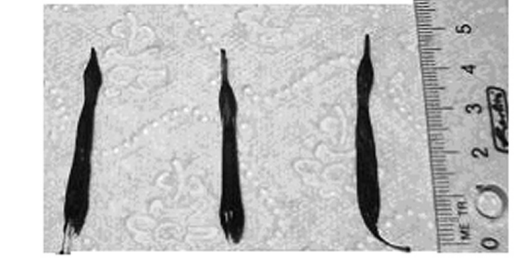
Fig. 3. Lisianthius nigrescens , the blackest flower in the world.

Gardeners and breeders of decorative plants have been trying for hundreds of years to breed and select for black flowers. Over many generations they have produced blossoms of dark purple, dark violet or dark chocolate. A species of tulip, Tulipa julia , has visible dark stains on the external side of its petals,