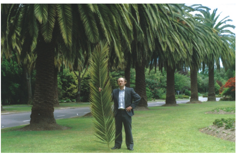
Palmerston North, New Zealand, 1986.