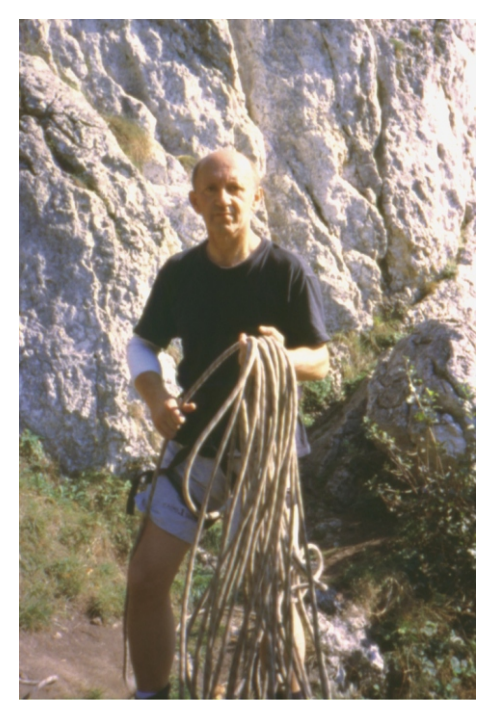
Cliffs near Cracow, 2001.