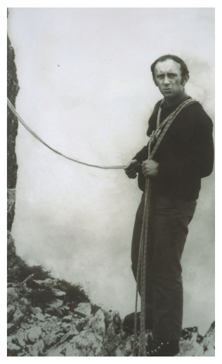
Cliffs near Cracow, 1967, before the climbing begins.